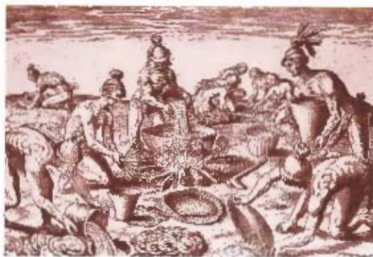
Florida Indian people preparing a feast, ca. 1565